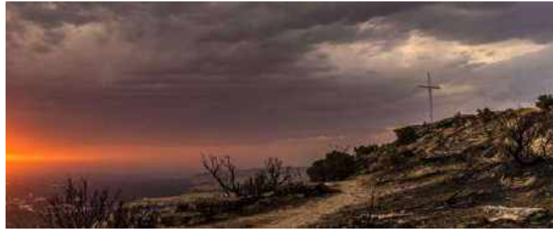
The Table Rock Fire in 2016 was started by a firework.

A good firework display can punctuate a holiday or celebration. While they are dazzling and exciting, fireworks are a major source in human-caused wildfires. Many towns in Idaho host spectacular holiday fireworks displays that provide safe alternatives. If you choose to light fireworks, your neighbors will thank you for checking local restrictions, assessing the fire danger beforehand, and cleaning up the debris post-celebration.