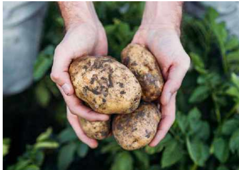
Idaho's world-famous potatoes