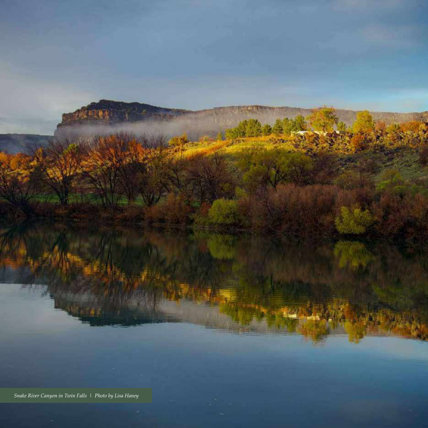
Snake River Canyon in Twin Falls