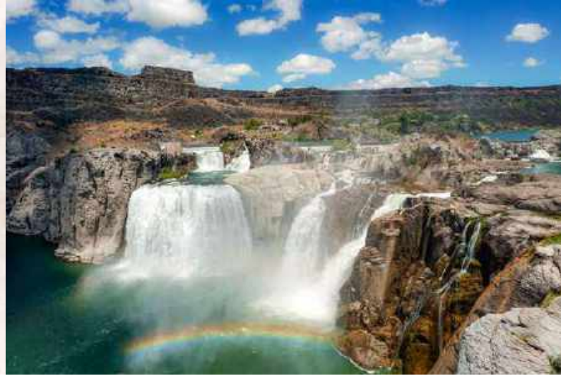
Shoshone Falls