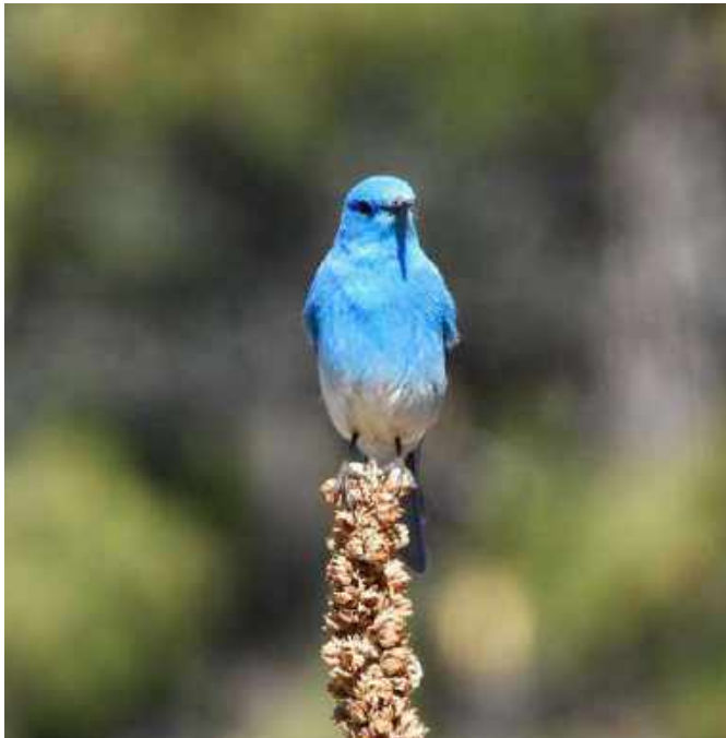
Left: Idaho's state bird, the Mountain Bluebird Below: Black Bear

The awe of Idaho's wildlife is universally inspiring. To see a bald eagle swoop to grab a fish in its talons, hear an elk bugling, spot a bighorn sheep in the mountains, or watch a Monarch butterfly sail by is motivation enough to want to do our part to ensure our grandchildren are afforded these same experiences.