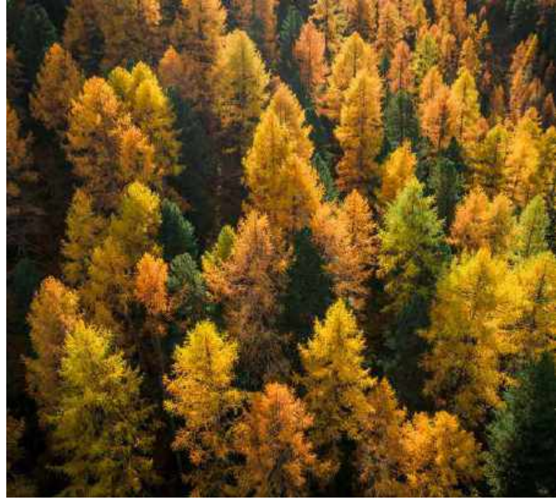
Western larch in North Idaho

Idaho has a native plant society in addition to the Bureau of Land Management native plants program. Next time you are out on a walk, take notice of all the different tree species you see. They are an essential part of the history and success of Idaho. Consider Idaho's native plants, their benefits, and how adapted and hearty they are when planning your landscape.