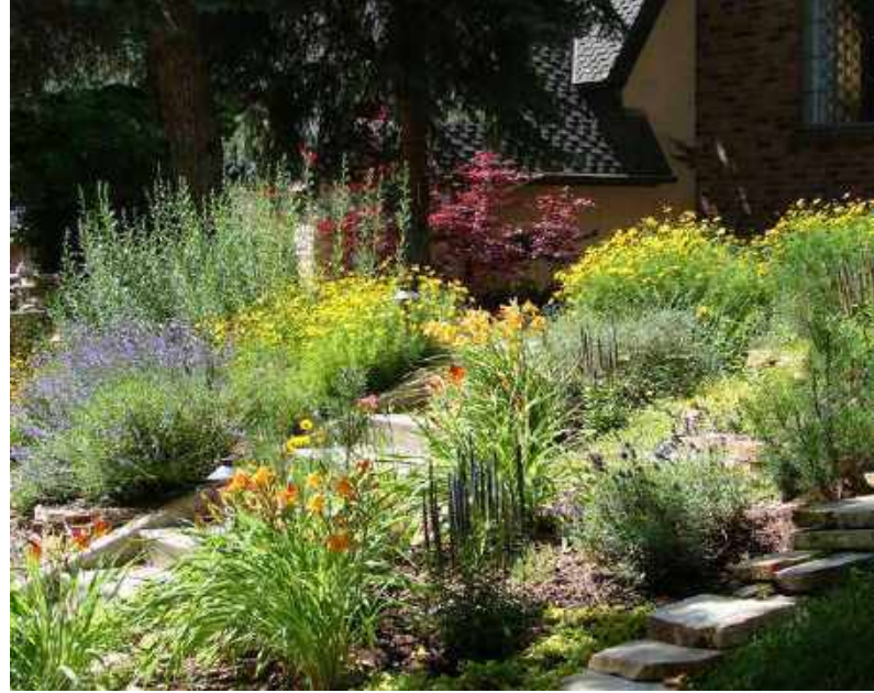
Left: Drought tolerant plants can be very aesthetically pleasing. Right: Xeriscape Garden