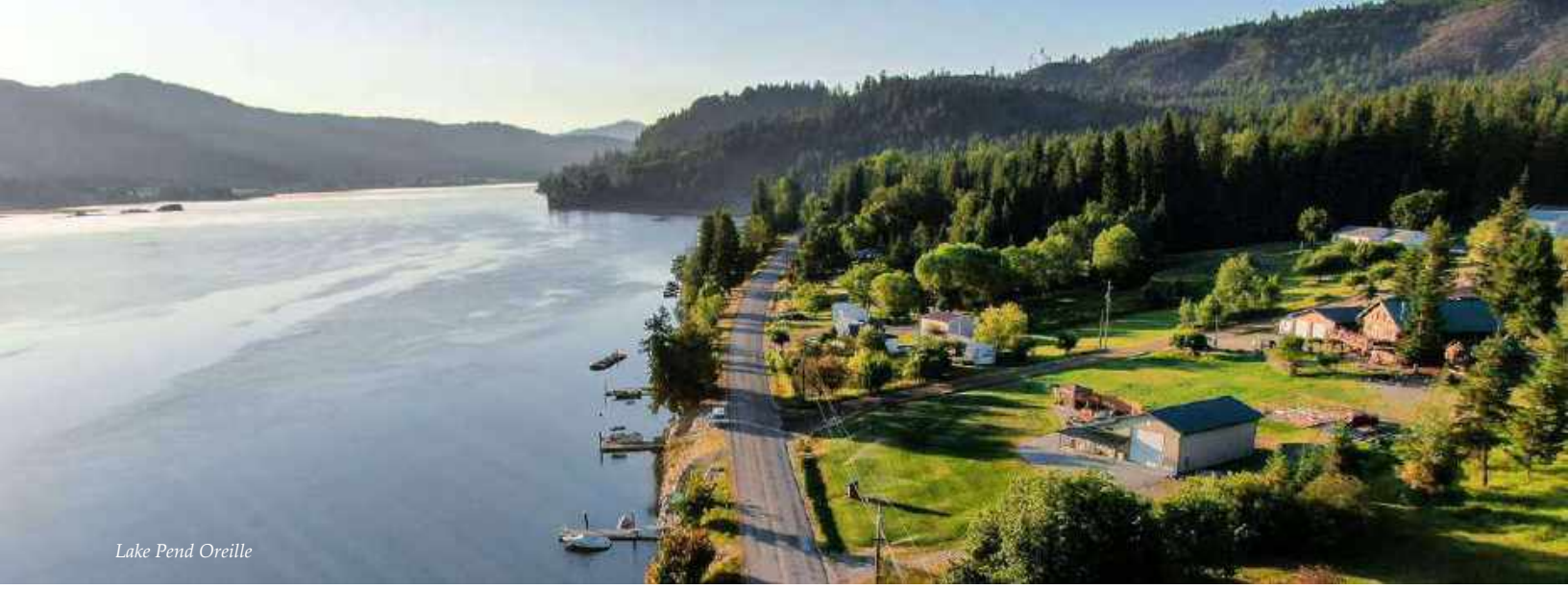
Lake Pend Oreille