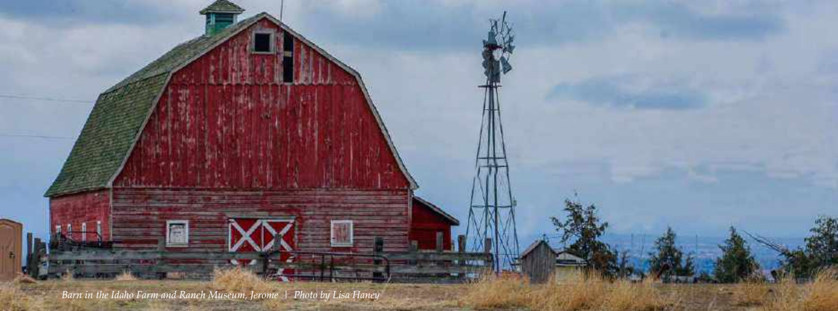
Barn in the Idaho Farm and Ranch Museum, Jerome