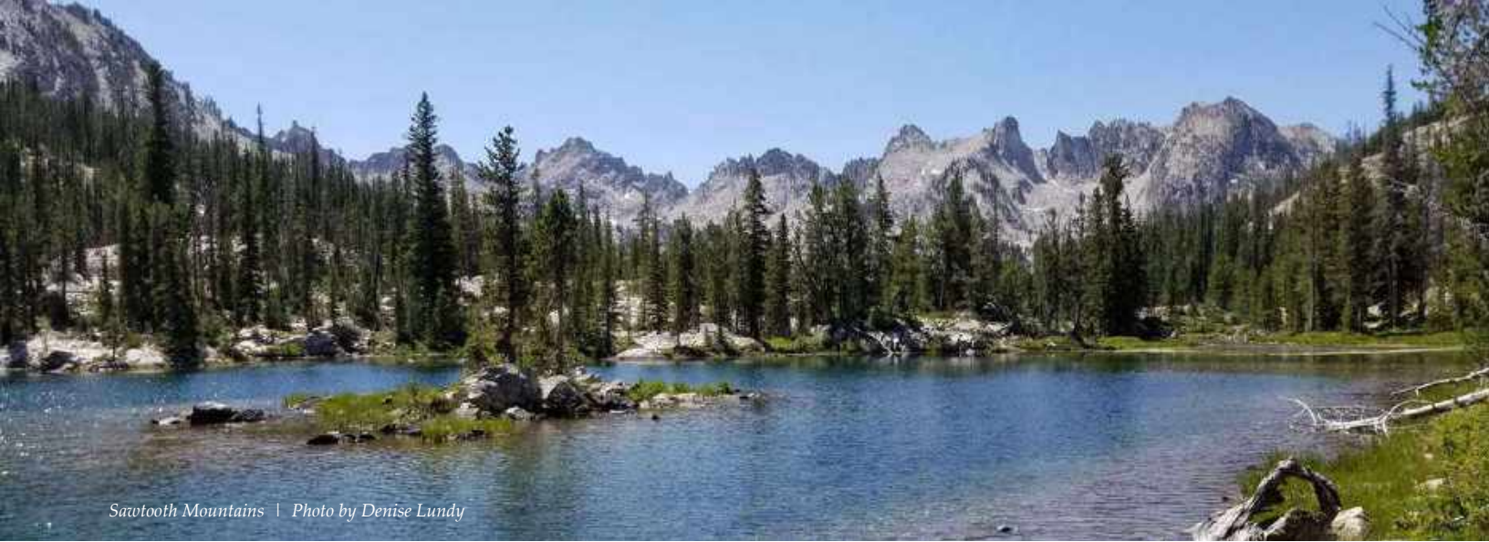
Sawtooth Mountains