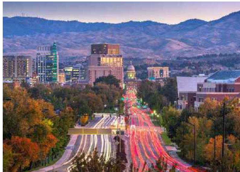
Idaho's capital city, Boise

It's no wonder that Idaho is known as the Wilderness State, with nearly 62% of its land being public lands and 14% of public land being designated wilderness areas. That's almost 33 million acres for exploration and adventure and a big draw for our tourism and recreation industries. When describing how preserved wilderness areas truly improve the quality of life for Idaho residents, former Governor Cecil Andrus referred to our public lands as "our second paycheck." This is why so many people flock to Idaho for an adventure holiday each year; it's home to the most navigable miles of whitewater in the lower 48 states and boasts 115 named mountain ranges. Idaho has over one hundred peaks over 11,000 feet in elevation and eight peaks that reach over 12,000 feet. The state's tallest mountain, Mt. Borah, reaches 12,662 feet.