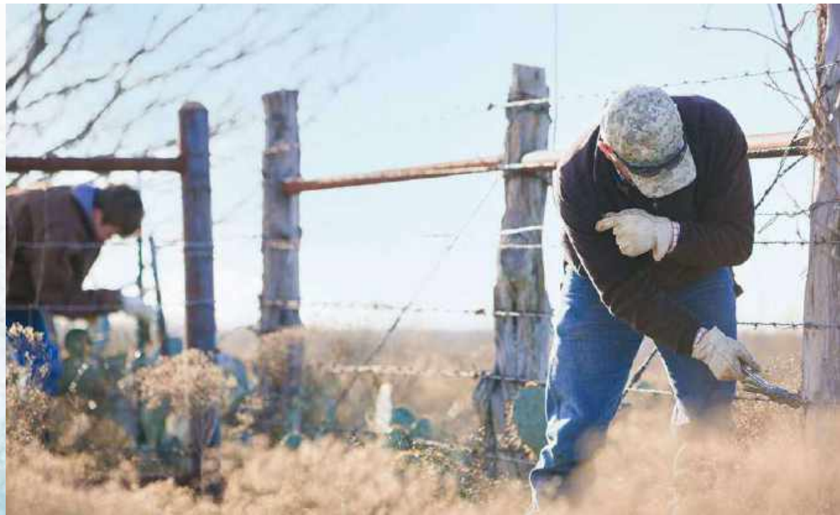
Neighbors helping neighbors

One of the advantages of living in Idaho is the commonality we share in loving this great state and wanting what is best for Idahoans. It's essential to preserve Idaho's natural beauty, resources, and communities for future generations. By working together and taking care of one another, we can ensure that Idaho continues to be a welcoming and vibrant place.