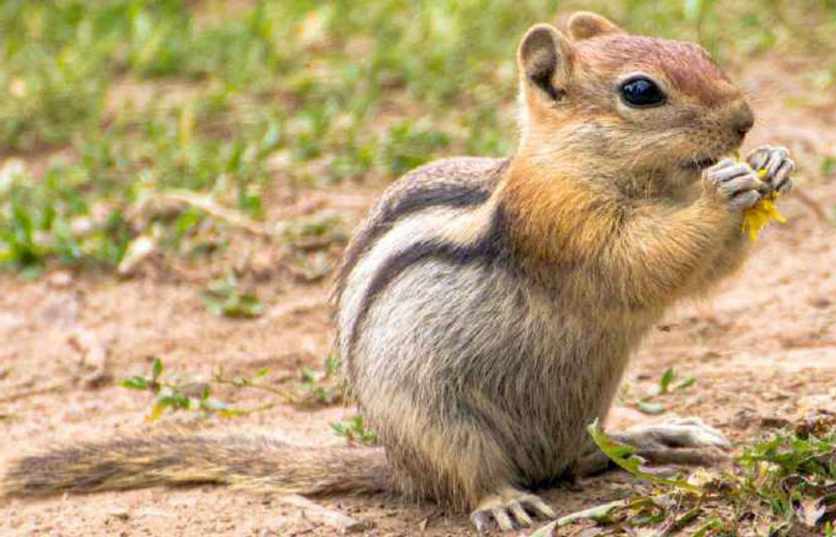
Left: Sockeye Salmon