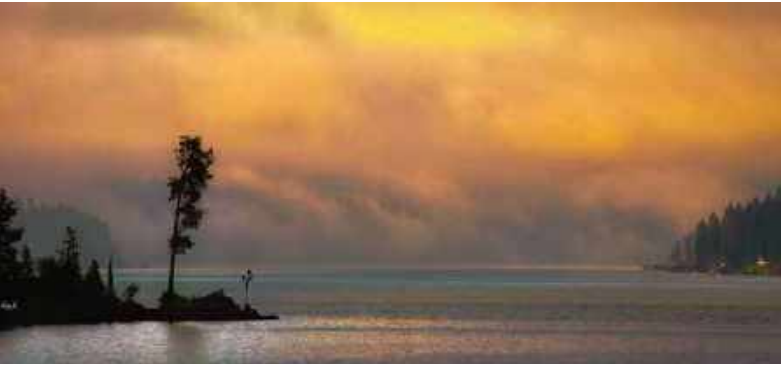
French Canadian fur trappers inspired the name Coeur d'Alene. (French for "heart of the awl")