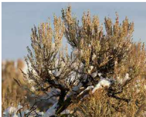
Top: Morel Mushroom

Once you've been here for a while, the arrival and disappearance of certain birds and plants will mark the seasons and become a measure of time. Wildlife depends on many native plants, such as blue bunch wheatgrass, whitebark pine, sagebrush, and huckleberries. These are unique as they cannot be cultivated and only grow in certain elevations. You can tell a North Idahoan likes you if they share with you their secret spot for picking wild huckleberries or morel mushrooms. Also elusive, is the Sacagawea bitterroot. This shy beauty grows between 5000 and 9000 feet of elevation in North Central Idaho's mountains. It pops up from the rock to bloom, and then, after blooming, poof! All above-ground traces disappear until next year!