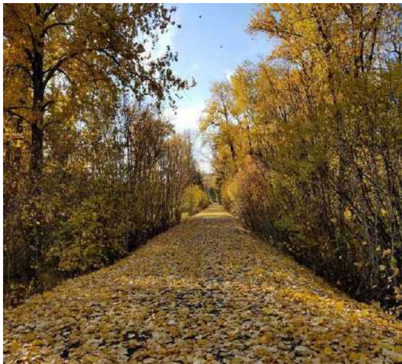
Trail of the Coeur d'Alenes in the Silver Valley