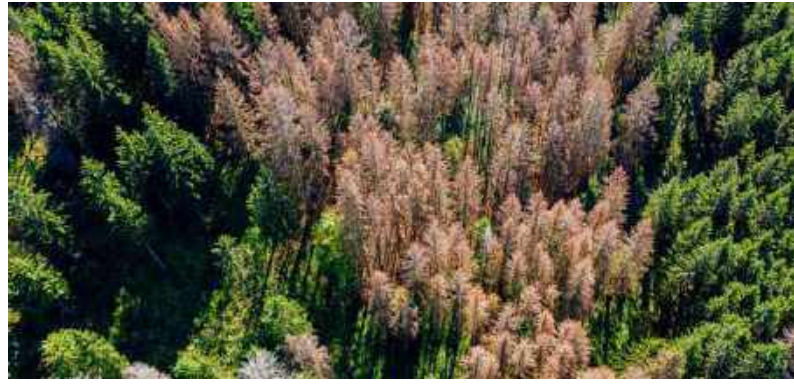
Tree destruction caused by Bark Beetles

The state also offers assistance to help mitigate grasshoppers, Mormon crickets and other pests on private land. The Invasive Species Idaho website has information on programs that may help you to rid your property of these invasive nuisances.