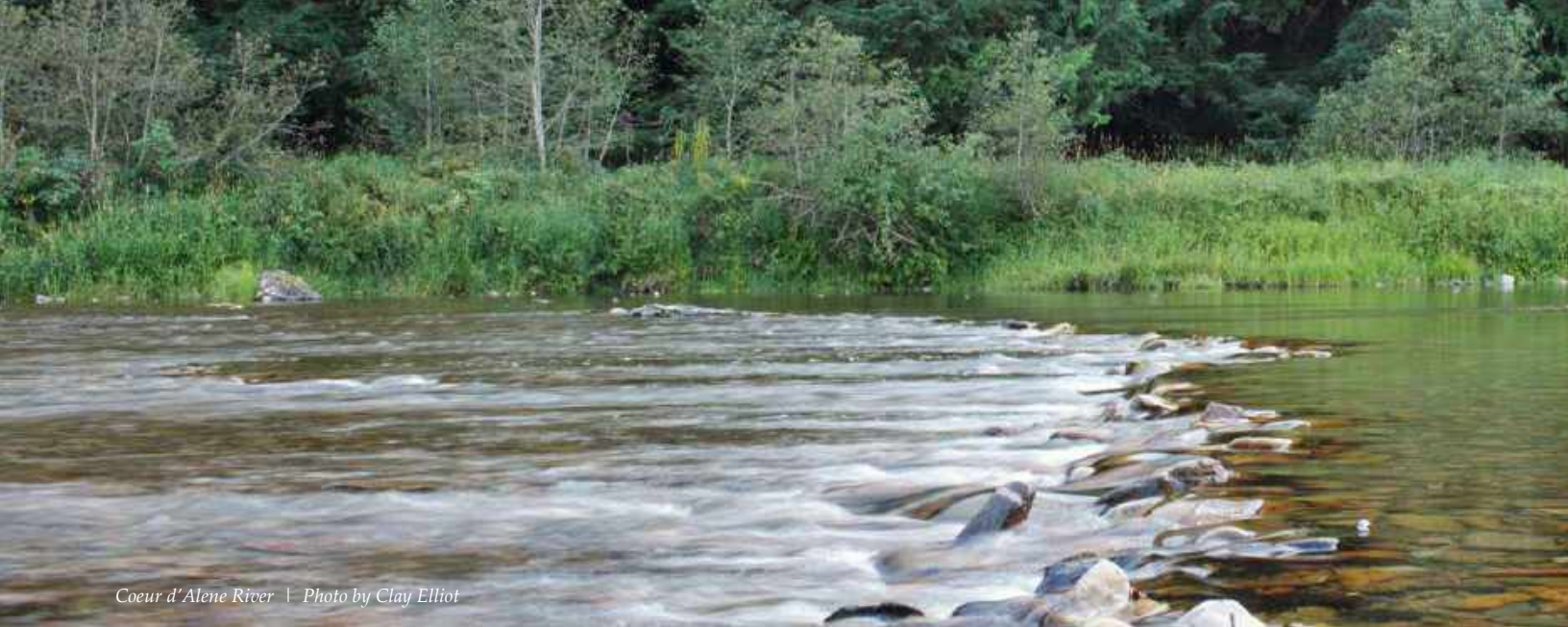
Coeur d'Alene River