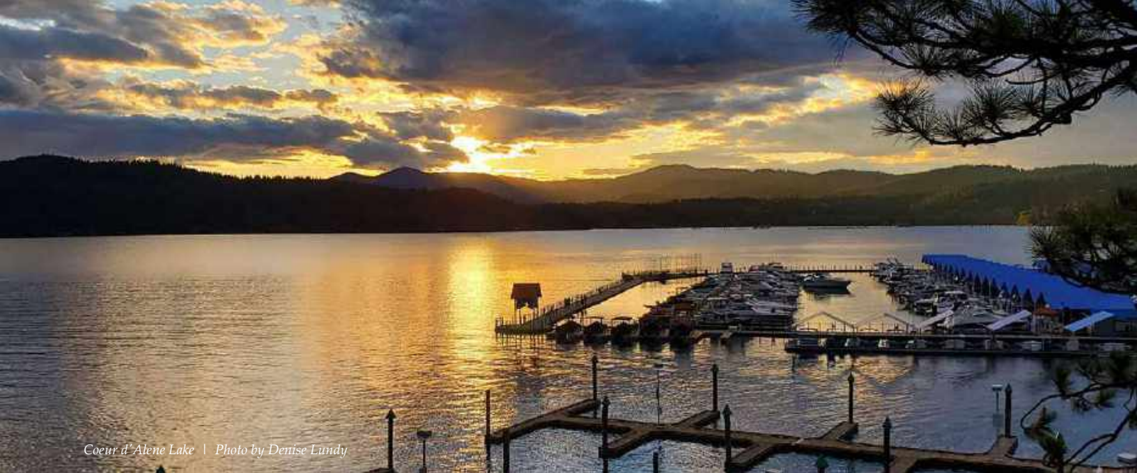
Coeur d'Alene Lake

Wetland habitats are vital to the countless species that depend on these riparian grasses, shrubs, and trees that cool water temperatures and keep the water clean by preventing runoff, erosion, and sedimentation. Cool, clean waters are necessary for salmon and steelhead to successfully complete their circle of life.