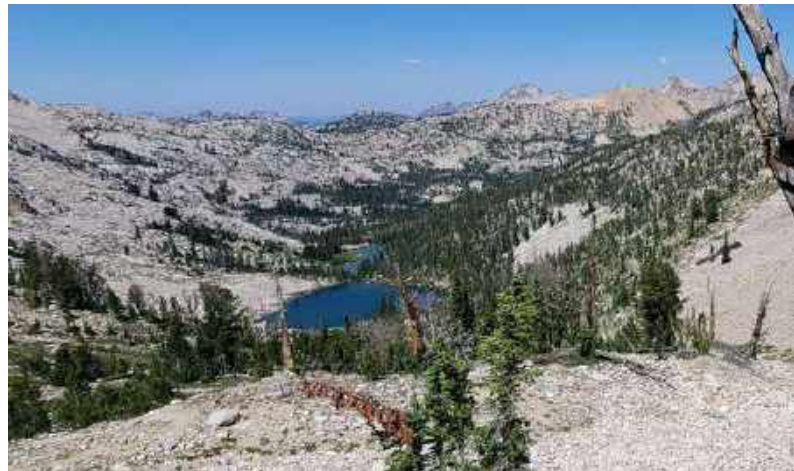
Top: Balanced Rock | Photo by Lisa Haney Bottom: Snowyside Pass | Photo by Denise Lundy