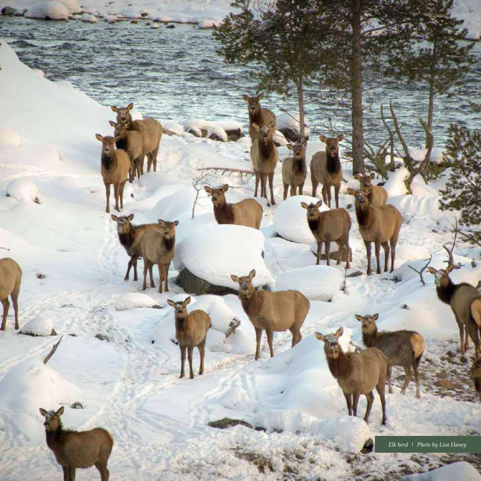
Elk herd