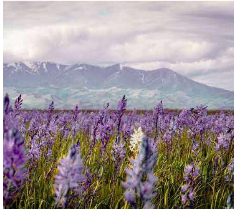
Camas Lily bloom in Fairfield

If you live in a more urban area, your city's forester will help you with tree selection based on heartiness, redundancy, and disease resistance in your area. You may have city right-of-way areas along the street frontage in front of your home