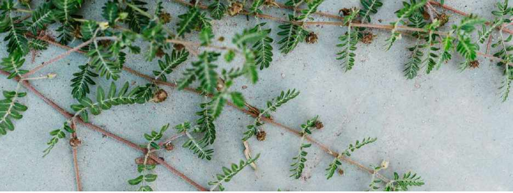
The infamous "Goathead" weed