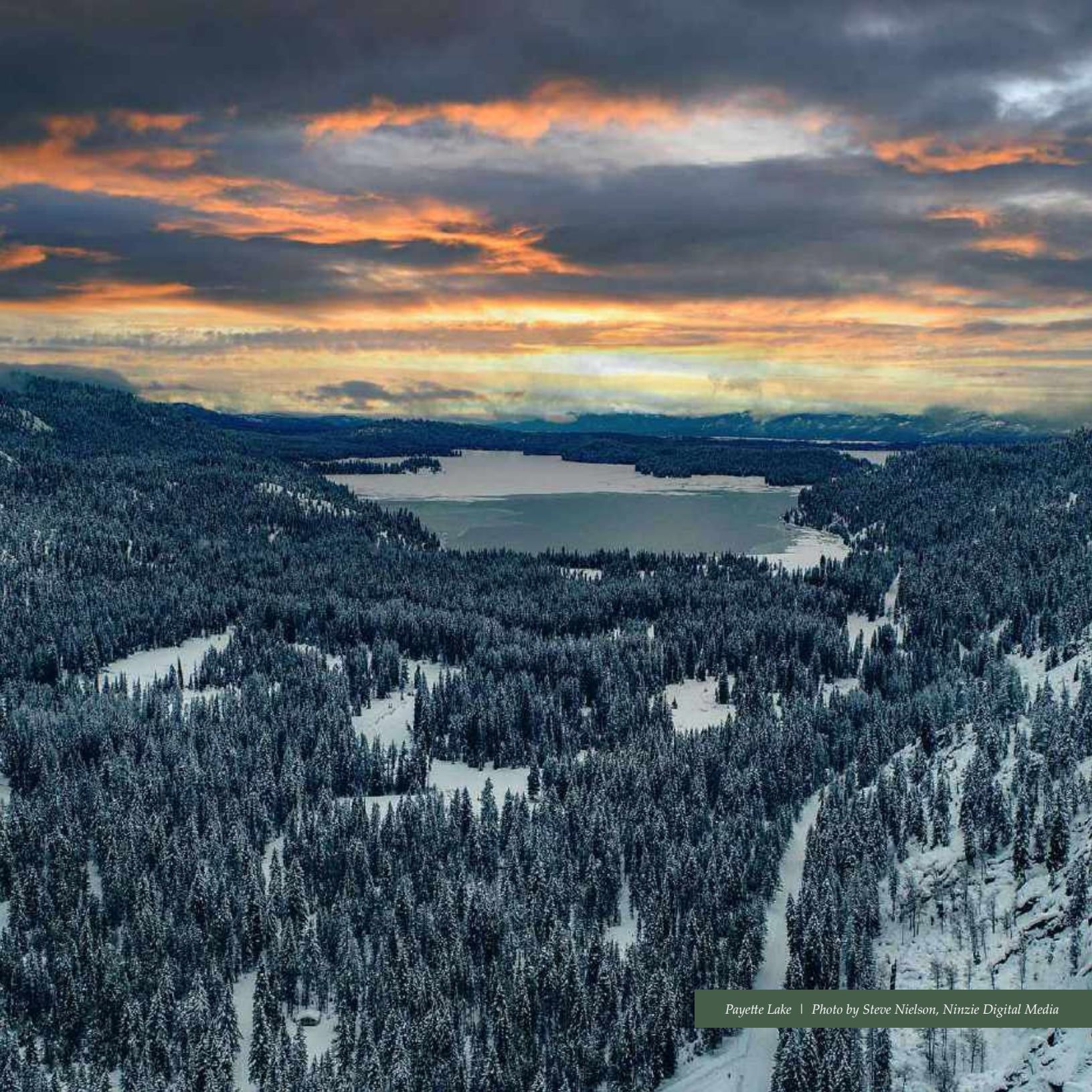
Payette Lake