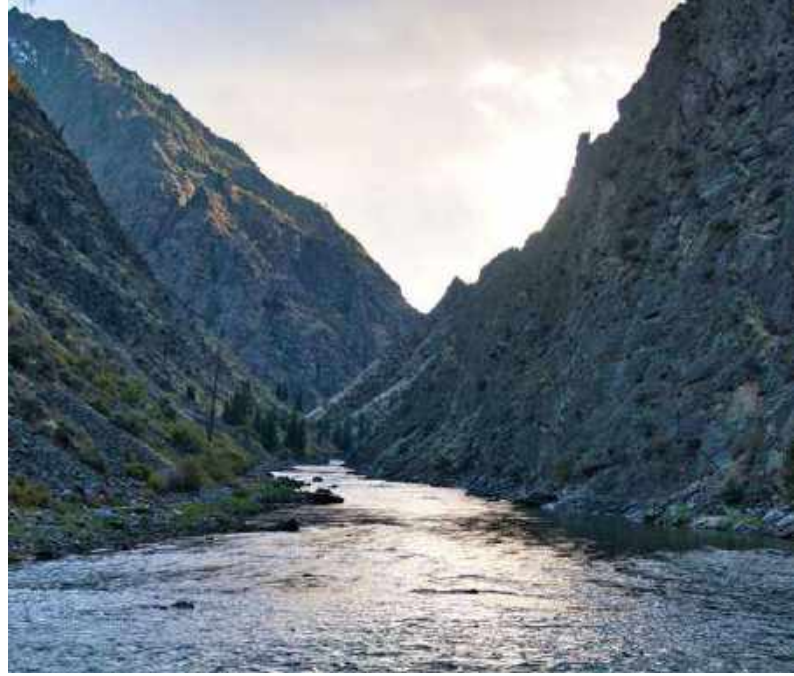
Frank Church River of No Return Wilderness Area

As one of the most remote places in the nation, the wilderness area provides a tranquil respite for rafting or fly fishing on the rugged Salmon River, viewing wildlife, discovering ancient pictographs, stargazing under a blanket of stars, hiking, and connecting with nature.