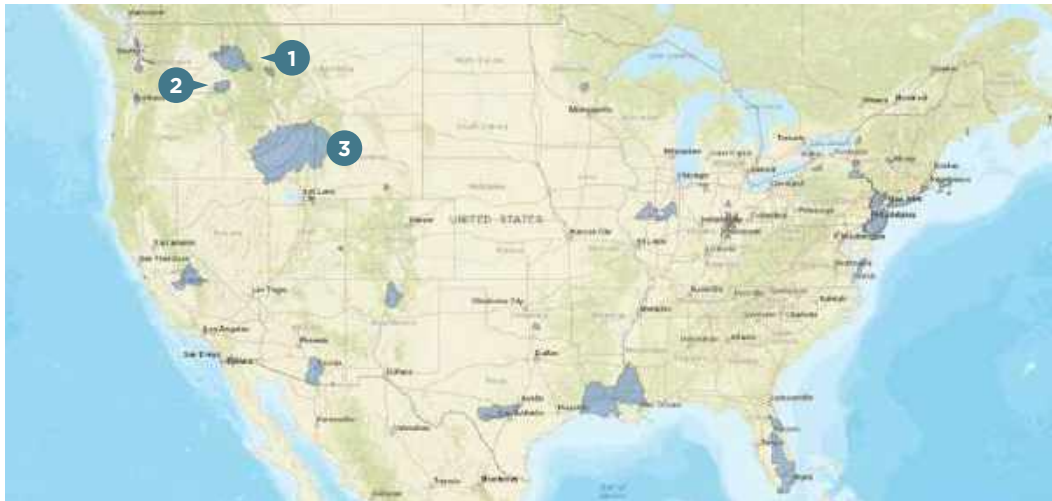
MAP OF THE SOLE SOURCE AQUIFERS IN THE UNITED STATES

We are lucky to have these world-class aquifers in Idaho. They are crucial to our state's prosperity. There is higher demand than ever for our state's water. In recent years, groundwater users in some areas have entered into an agreement to reduce usage to prevent the decline of the aquifer and in an effort to recharge the source.