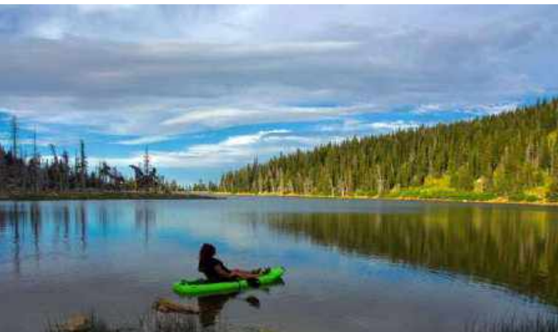
Lake Cleveland